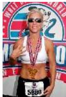
Walt Disney World Marathon Orlando, FL