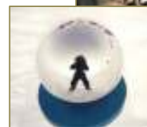
Dallas at the South Pole